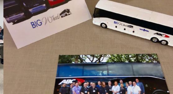
A FEW CANDIDS FROM THE FIRST BUS EDUCATION SEMINAR ... APRIL 2019